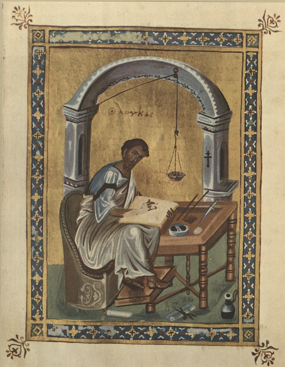
Plate 1. St. Luke. See page 6

From the ninth to the fifteenth century the Byzantines conceived of themselves as Romans and of the Greek classics as their special heritage. But it seems increasingly clear that the conservative character of their civilization has been much overestimated. Until the fifteenth century it remained characterized by zest for experiment and for a sophisticated modernity in thought, in science, in literature and in painting. Even new barbarian sources would at times be utilized precisely because exotic and bizarre. The continual innovations in literary form seemed closely paralleled by experimentalism in painting. When the origins of Italian Renaissance painting come to be restudied it may be decided that much that is termed Byzantine in the handbooks is in fact old-fashioned provincial Italian and that some at least of its most character-